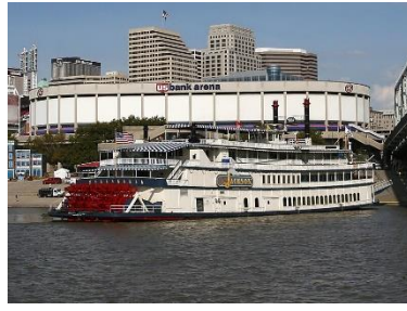
General Jackson Showboat