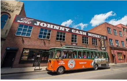
Old Town Trolley