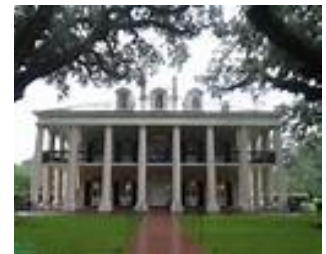
Oak Alley Plantation

The guided Laura Plantation tour is based upon 5,000 pages of documents related to this plantation discovered in the Archives Nationales in Paris, with the major stories coming from Laura Locoul Gore's book "Memories of the Old Plantation Home." Our tour begins with a visit through the Manson Principale , built in 1805, into its raised basement and galleries, and into its men's and women's chambers, and its offices, service rooms and common rooms. You will see Laura's family heirlooms and their Creole furnishings and be introduced to age-old Creole traditions. The visit moves to the grounds surrounded by sugarcane fields and 12 buildings on the National Register ; and then into the formal gardens and the kitchen garden. The tour places visitors at the exact locations where sobering events of human slavery happened. Our tour concludes in one of the 1840 slave cabins where the ancient west-African folktales of Compair Lapin , better known as the legendary "Br'er Rabbit" were recorded.