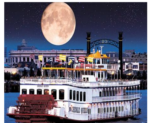
Creole Queen Paddlewheeler hosts dinner/jazz

New Orleans each year attracts nearly 10 million visitors to its world-class attractions and fun activities and in 2017 CACers from coast to coast will be among them. In what promises to be one of the most exciting annual convention/vacations ever for Catholic Alumni Clubs International, YOU are invited to experience the great fun, food, sight-seeing, music, tours, social activities and much more from Sunday, July 9 to Saturday, July 15. Our hotel will be the four-diamond Loews New Orleans located in the heart of the city, just three blocks from Bourbon Street, three blocks from the Spanish Wharf on the mighty Mississippi River bank and across the street from the spectacular Harrahs Casino with its 1,700 slots and 100 gaming tables. Our 285-room hotel is also convenient to many restaurants, shopping and sight-seeing opportunities. It has been voted as one of the "Top 50 Large City Hotels in the U.S." by Travel & Leisure Magazine and is within walking distance of the famous French Quarter. All of its rooms were recently renovated and guests may enjoy its indoor pool, sauna, whirlpool and paid on-site valet parking. Its Cafe Adelaide restaurant and Swizzle Stick Bar are operated by members of the noted Brennan family of New Orleans restaurateurs.