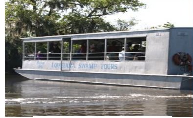
Swamp Tour Boats

Experience the National World War II Museum located just six blocks from our hotel. As of 2016, it is ranked as the Number One Attraction in all of New Orleans by Trip Advisor; the Number Four Top Museum in the U. S.; and the Number Eleven Top Museum in the world! Established in 2000 and designated by Congress as America's official WWII museum in 2003, the museum features a rich collection of artifacts that bring history to life.