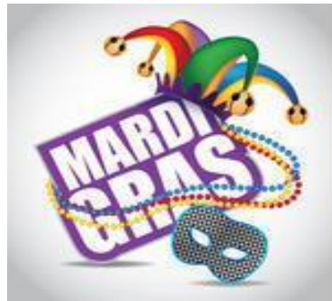
See Mardi Gras Floats being created