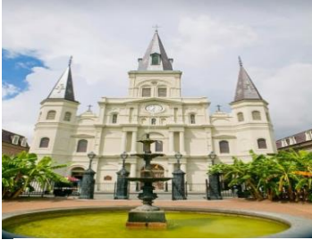
St. Louis Cathedral-Basilica

New Orleans was founded in 1718 by Jean-Baptiste Le Moyne as a French colony. In 1762, it was ceded to Spain; and in 1802 France regained New Orleans as part of Napoleon's European wars. The following year 1803, France sold the city as part of the Louisiana Purchase to the United States. In 1812 Louisiana became a state with New Orleans as its first capitol. By 1840, the city grew to be the wealthiest and third largest in the U. S. (behind New York City and Baltimore) with a population of 102,000.