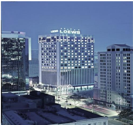
Our 24-story Loews Hotel is top rated