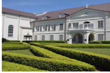
Old Ursuline Convent