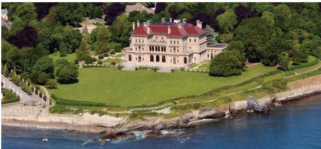
A spectacular view of one of the Newport "Summer Cottages" of the 1890's

On Monday evening, we will enjoy an authentic New England clambake and dinner on the shore of one of Rhode Island's beautiful beaches. For those not into clams, a steak dinner will be substituted.