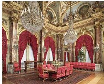
A view of the interior of "The Breakers", the Vanderbilt mansion constructed for $11 million in the 1890's