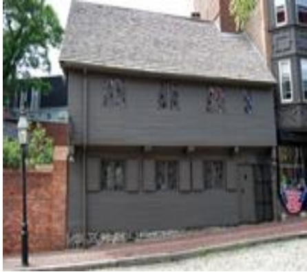
The Paul Revere House is on Boston's Freedom Trail