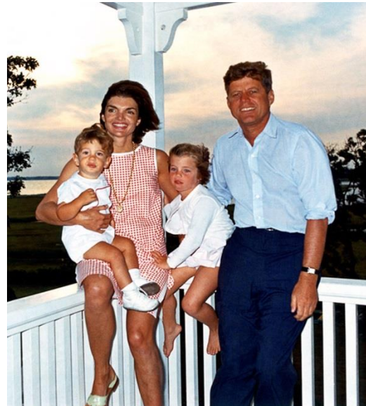
The John F. Kennedy Library contains many interesting items from the lives of our 35th President, his wife and children.

A tour to Plymouth Rock and Plymouth Village will be unique (no matter how you spell Plimoth!). In December 1620, the Pilgrims landed at Plymouth Rock. During the first winter, half of the 102 people who sailed on The Mayflower from England perished from cold and hunger. The reconstructed Village at Plimoth Plantation is a bi-cultural living-history museum of 17th century culture. Costumed interpreters portray settlers in the 1627 English Village, which is complete with homes, barns, gardens and a fort. At the recreated Wampanoag Indian homesite, interpreters teach about their culture.