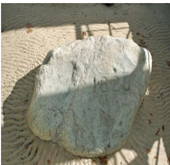
Plymouth Rock was the landing site of the second permanent English settlement in America

Our hotel contains 266 oversized guest rooms and sits on an 88 acre campus. There is complimentary shuttle service from the Providence Airport (the T. F. Green Airport) less than three miles away. The Crown Plaza (801 Greenwich Avenue, Warwick, RI; [401] 732-6000) is located just off Interstate 95 at Exit 12 and offers acres of free parking. For several years, it has won awards for outstanding service and superior quality. The hotel offers an indoor pool, whirlpool spa and sauna, a health and fitness center, an award winning restaurant (Remingtons) and Alfred's Library Lounge; as well as a business center and concierge service. All rooms have marble baths with two sink vanity, individually controlled air conditioning and heating, complimentary high speed access, 25-inch televisions and much more. The hotel has several service vans to provide complimentary shuttle service to nearby restaurants, shopping, etc. There will be a CACI Hospitality Room off the hotel lobby that will be open most days and evenings as well as for "after hours".