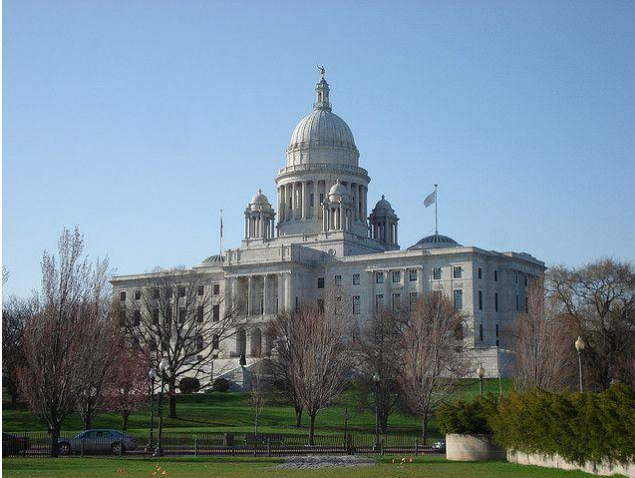
Rhode Island Capitol Building is located in downtown Providence

A popular tour will be to Newport on the ocean with its famous 1890's era mansions (or summer "cottages" as the Vanderbilts called them). Our tour will include an inside visit to "The Breakers", the 70-room summer home constructed for Cornelius Vanderbilt II in 1895 for $11 million. His great wealth is reflected in the extensive use of imported French and Italian stone, marble and alabaster as well as the mansion's wooden trim, hand painted ceilings, mosaics and gilded plaster. The 18th century great hall is more than two stories high and arrayed with marble columns, pilasters, cornices and plaques.