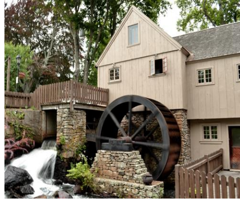
The Grist Mill is one of several reconstructed Plimoth Plantation sites.

Providence was named by Travel+Leisure magazine as the 2014 Number One Favorite City to visit. The city won acclaim for "brimming with New England charm", and being "a legitimate culinary capital" and having numerous historical elements. Other finalist cities included Minneapolis/St. Paul, San Francisco, Kansas City and Houston.