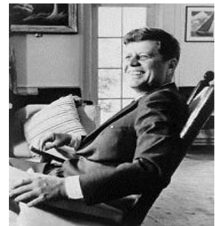
The John F. Kennedy Presidential Library and Museum offers more than 20 multimedia exhibits and period settings at the nation's official memorial to President Kennedy.