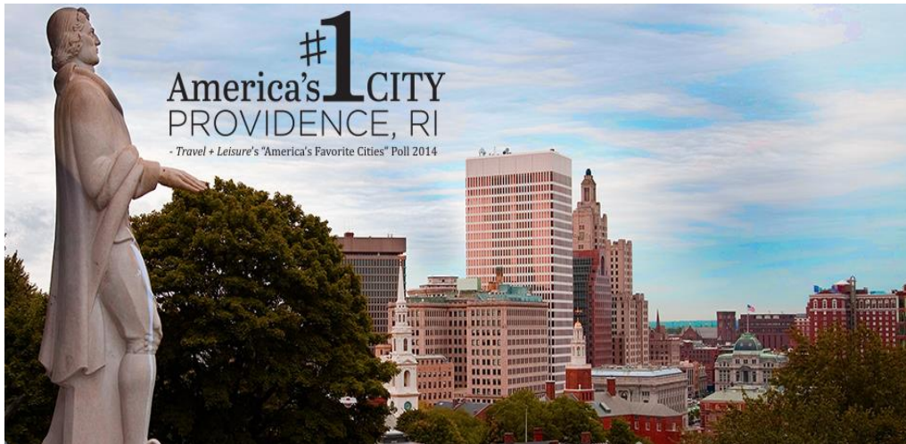
Statue of Roger Williams who founded Rhode Island in 1636 overlooks the city of Providence

Make your plans now to attend the fabulous 2015 Convention/Vacation of Catholic Alumni Clubs International scheduled at the Crowne Plaza hotel in the Providence, Rhode Island suburb of Warwick from Sunday afternoon, July 19 , to Saturday afternoon, July 25 . This 55th annual gathering of CACers from throughout the United States will include social events, daily mass, elaborate breakfasts, four hotel banquet dinners, a clambake on the shores of Narragansett Bay on Monday evening and much more in addition to opportunities to sign up for several historic and culinary tours .